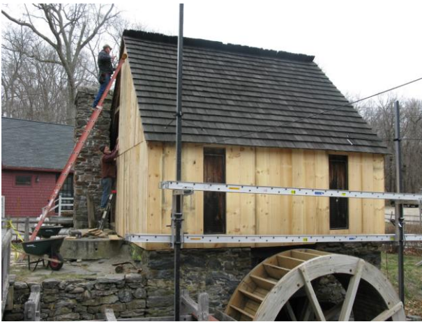
March 2011 Restoration of the Hammond Gristmill