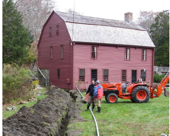
December 2010 trench for burying electrical service in conduit

Now you see it... Now you don't: It has been a long time goal to relocate the electrical wires to the Birthplace to an underground conduit. Thanks to a donation from the Harmony Lodge #5, a donation by Ferguson Perforating and Wire Co, and special consideration by Trident Fence Company, R. K. Electric, L.L.C., and volunteers ready to do some shoveling and lawn work, we were able to achieve this goal in December. National Grid removed the wires from the pole and voila! No more need to Photoshop the electrical wire out of your photographs of the Birthplace.