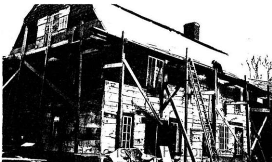
1931 Restoration in progress