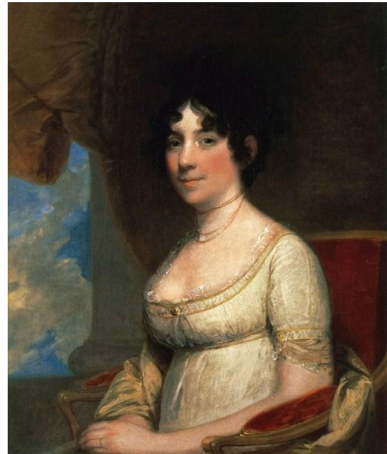
Dolley Madison by Gilbert Stuart