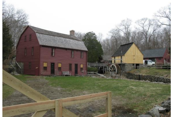
March 2011 electrical service no longer visible!

Stuart Reproduction Portraits for the Museum: